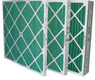
Diagonal support members, glued to each pleat at its apex, help maintain pleat stability and filter rigidity.