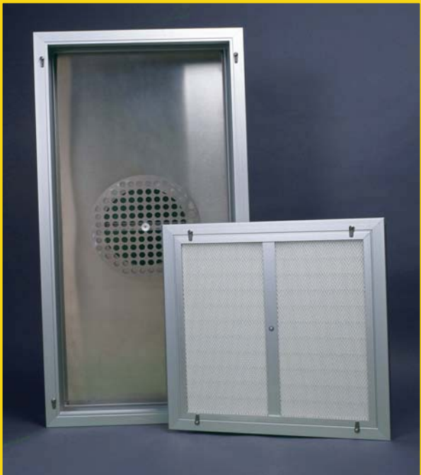
A room side replaceable ducted terminal filter housing offering high